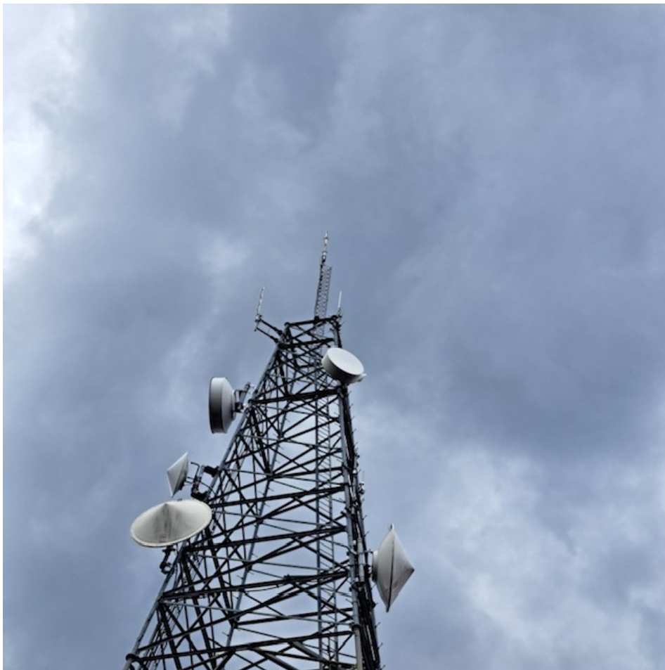
The Diamond X50N antenna is installed on the right leg of the tower above the communications link dish shown in the picture.

Announcements will be made when it becomes active.